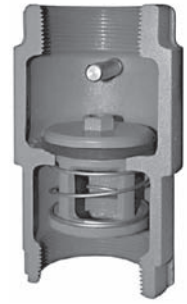
530 D with BREAK OFF PLUG