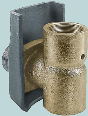
Brass Insert and Cast Steel Housing featuring 304 stainless steel flanged nipple

Maass JS Adapters are ideal for use in sewage basins, pressurized sewage systems, cisterns and sump pump installations.