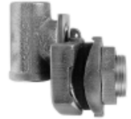
JRS, LDS, S-SERIES