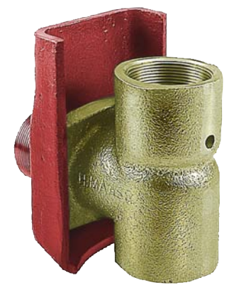
Brass Insert and Cast Steel Housing featuring 304 stainless steel flanged nipple and guide pins